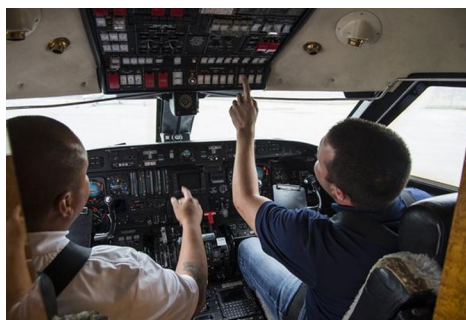
Hallmark University students in the College of Aeronautics are able to train on a Gulfstream III.